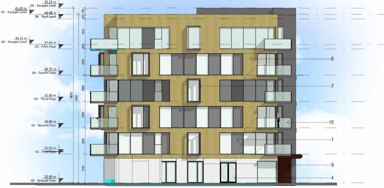
2 North 1:200