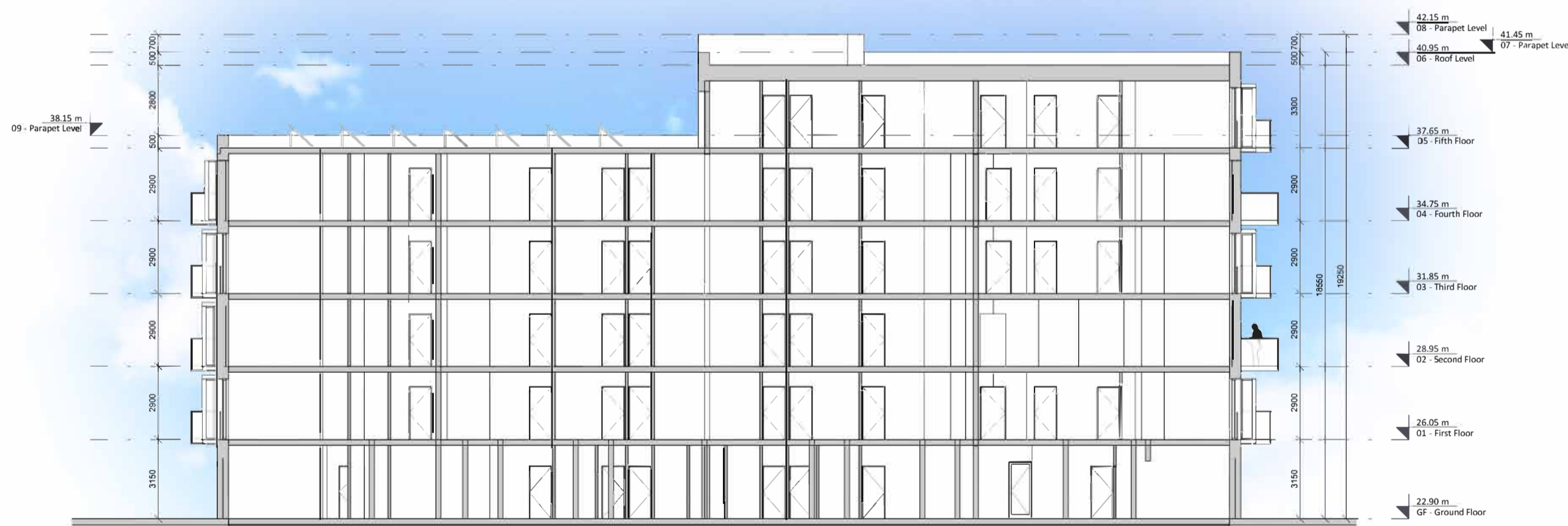
5 Section 1 1:200