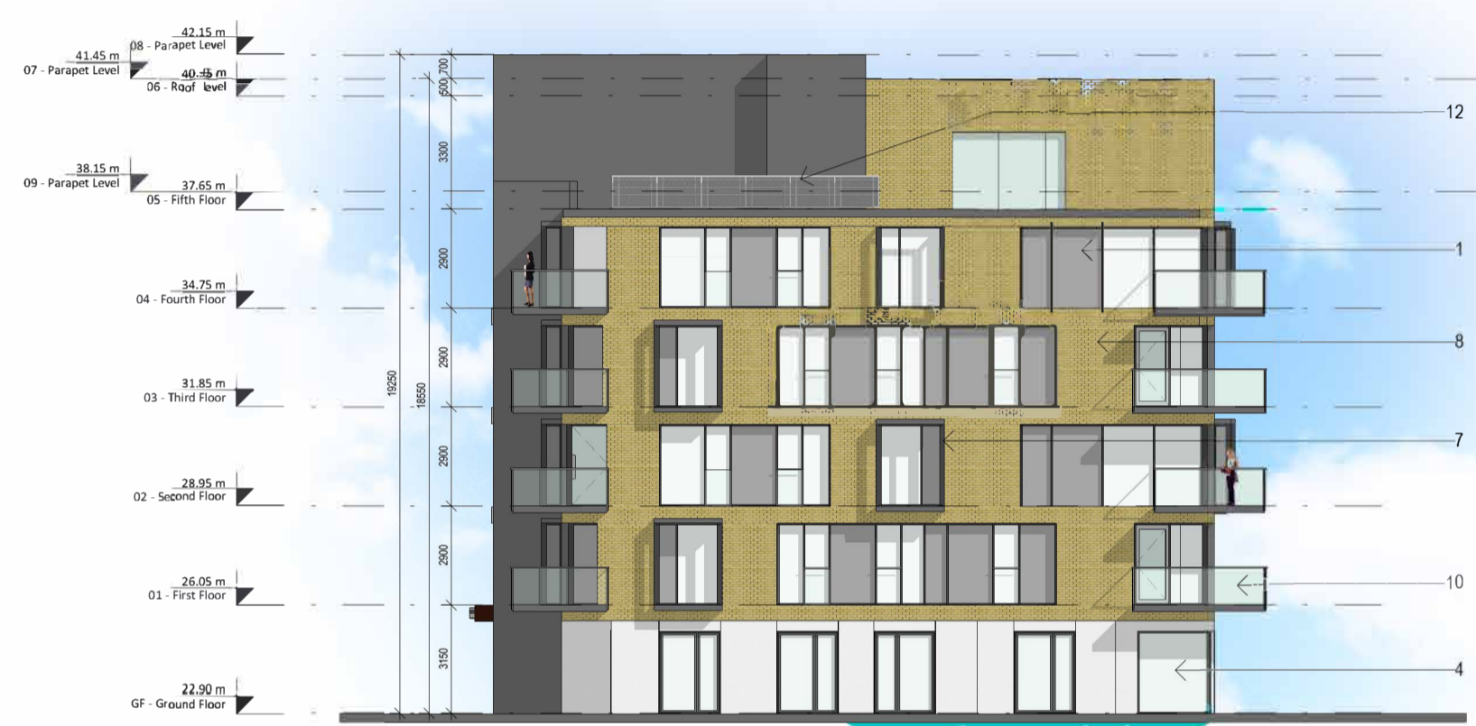
3 South 1:200