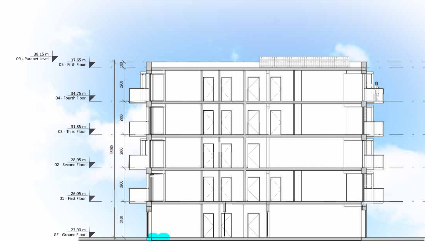
6 Section 2 1:200